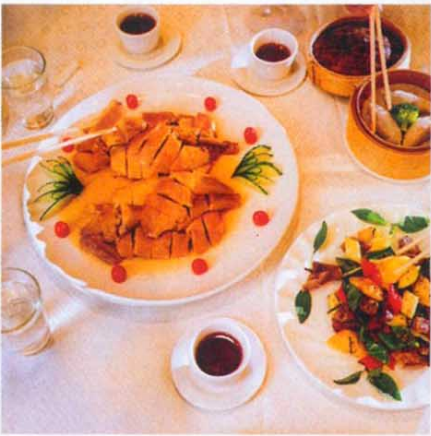
Clockwise from left: Shopping for jewelry at Front & Company, in Vancouver; dim sum at Jade Seafood, in Richmond; walking down Water Street, in Vancouver's Gastown area; a view of Grouse Mountain from Stanley Park.