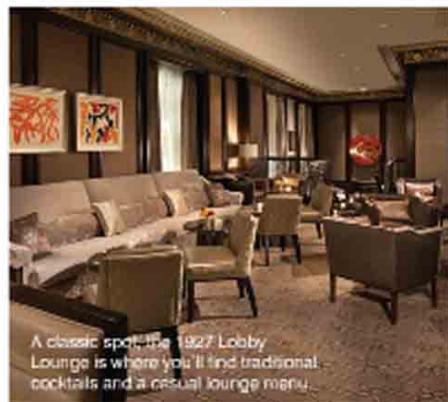
A classic spot: the 1927 Lobby Lounge is where you'll find traditional cocktails and a casual lounge menu.