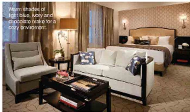
Warm shades of light blue, ivory and chocolate make for a cozy environment.