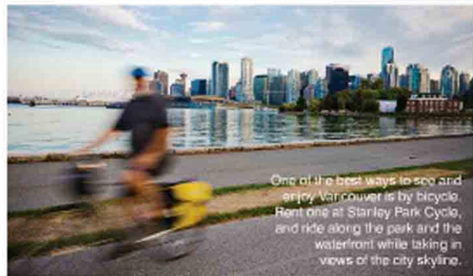
One of the best ways to see and enjoy Vancouver is by bicycle. Rent one at Stanley Park Cycle, and ride along the park and the waterfront while taking in views of the city skyline.

To make your biking trip extra special, head across the Granville bridge and onto Granville Island ( granvilleisland.com ), a peninsula physically connected to the city and actually considered part of downtown Vancouver. It is most famous for being a center for great cuisine and a haven for arts and culture. Leave plenty of time for the Public Market ( granvilleisland.com/public-market ), Granville's oldest and most established farmers market. Sample from stands full of seasonal, colorful fruits and veggies, freshly baked breads and pastries, maple syrup, and, of course, the local delicacies—cured salmon jerky, sausage and pepperoni sticks. Buy a slice of savory or sweet pie at A La Mode ( alamodepie.com ), and enjoy it outside while watching the boats sail by. If the weather is chilly, grab a cup of hot tea from Granville Island Tea Company (1689 Johnston St., granvilletea.com ) to go with your pie. Get inspired by browsing through Make shop (1648 Duranleau St., makevancouver.com ), an unusual concept with funky gifts and custom-made items that can be created right on the spot. You are guaranteed to be occupied for a while, touching practically every piece of the store's vast collection of unique cards, gifts and knick-knacks. Be sure to watch the sunset before riding back into town. —BETH WEITZMAN AND ELINA FUHRMAN