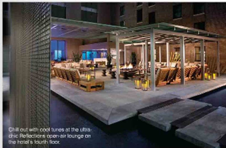
Chill out with cool tunes at the ultra-chic Reflections open-air lounge on the hotel's fourth floor.