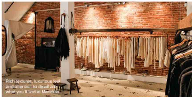
Rich textures, luxurious feel and attention to detail are what you'll find at Mancova.