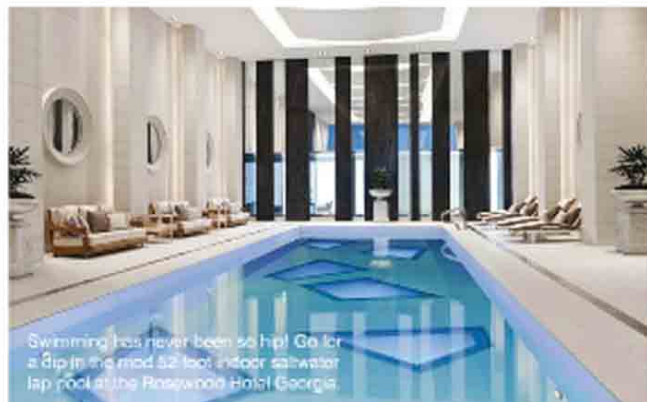
Swimming has never been so hip! Go for a dip in the mod 52-foot indoor saltwater lap pool at the Rosewood Hotel Georgia.