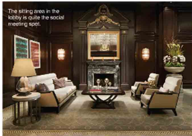
The sitting area in the lobby is quite the social meeting spot.