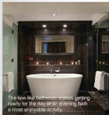
The spa-like bathroom makes getting ready for the day or an evening bath a most enjoyable activity.