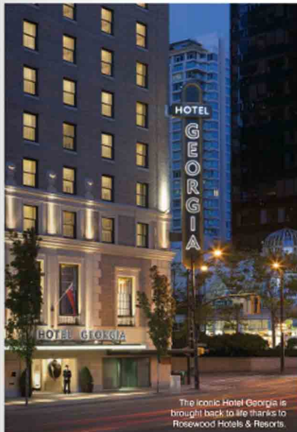
The iconic Hotel Georgia is brought back to life thanks to Rosewood Hotels & Resorts.