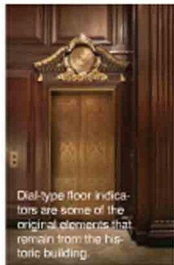
Dial-type floor indicators are some of the original elements that remain from the historic building.