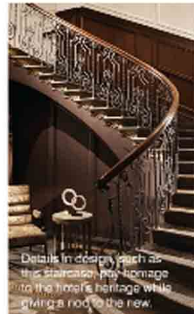
Details in design such as this staircase pay homage to the hotel's heritage while giving a nod to the new.