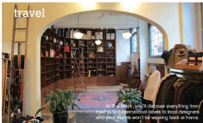
At The Block, you'll discover everything from hard-to-find international labels to local designers who your friends won't be wearing back at home.