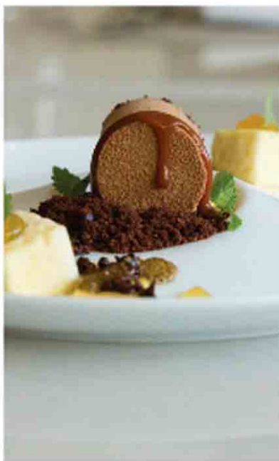
Enjoy dining in front of a vast, open kitchen at pan-Asian bistro Oru at the Fairmont Pacific Rim Hotel.