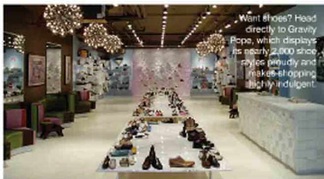
Want shoes? Head directly to Gravity Pope, which displays its nearly 2,000 shoe styles proudly and makes shopping highly indulgent.