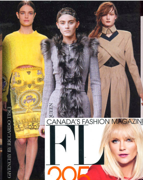
GIVENCHY BY RICCARDO TISCI